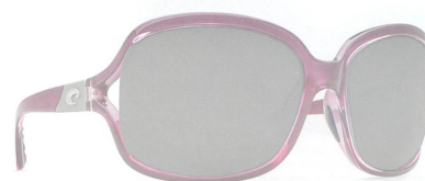
COSTA SUNGLASSES BOGA

It's no longer just the fly anglers who rely on polarised sunglasses to benefit their sessions. European-style carp anglers are big users of polarised eyewear as they seek to spot carp feeding from vantage points such as trees. Predator anglers are big users of this kind of eyewear too, because spotting species such as pike vastly increases the ability to catch them because you can cast to them or tailor your retrieve to entice a bite.