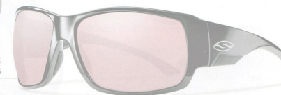
SMITH OPTICS DOCKSIDE SUNGLASSES