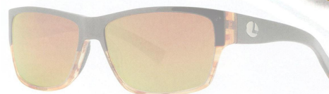
LENZ OPTICS DEE