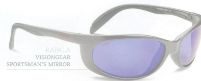
RAPALA VISIONGEAR SPORTSMAN'S MIRROR