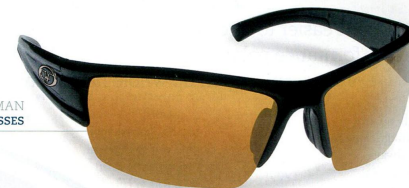
FLYING FISHERMAN EDGE SUNGLASSES